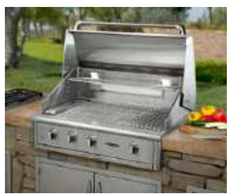
Quality Hand Crafted Construction

Zone cooking allows optimisation of temperature zones. Each burner has a heat divider between them which prevents the heat diverting to the neighbouring zone.