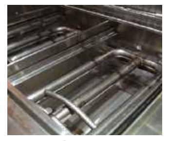
Zone Cooking Feature

Provides additional cooking space and room to cool your perfectly cooked meats before serving. Can be easily removed.