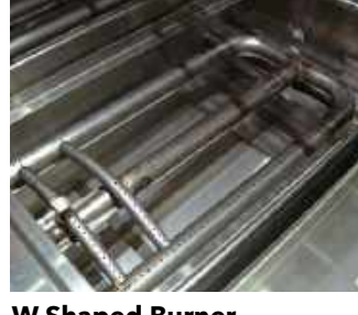
W Shaped Burner

The stainless steel smoker box (sold separately) will have you creating deep, smoky flavours in your BBQ.