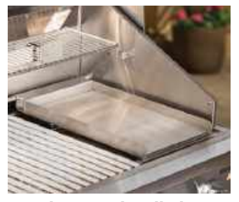
Stainless Steel Grill Plate

Capital offers a Two Year Full Warranty covering all parts and labour to ensure peace of mind.