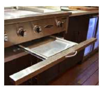
Smart Drip Tray

The thickness of the plate helps to make it extremely durable and maintain temperatures.