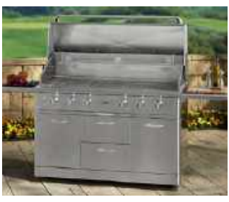
Stainless Steel Hood

Smart drip system which catches fats and oils. Sitting below the grill surface, the tray is supported by a ball bearing slide system and is removable to make it easy to clean.